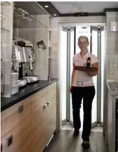
Automatic Gilgen folding door FFM for the maximum possible opening, even when space is limited.

The complete range of selectable functions and available control and safety elements enables you to find the optimal solution for your situation.